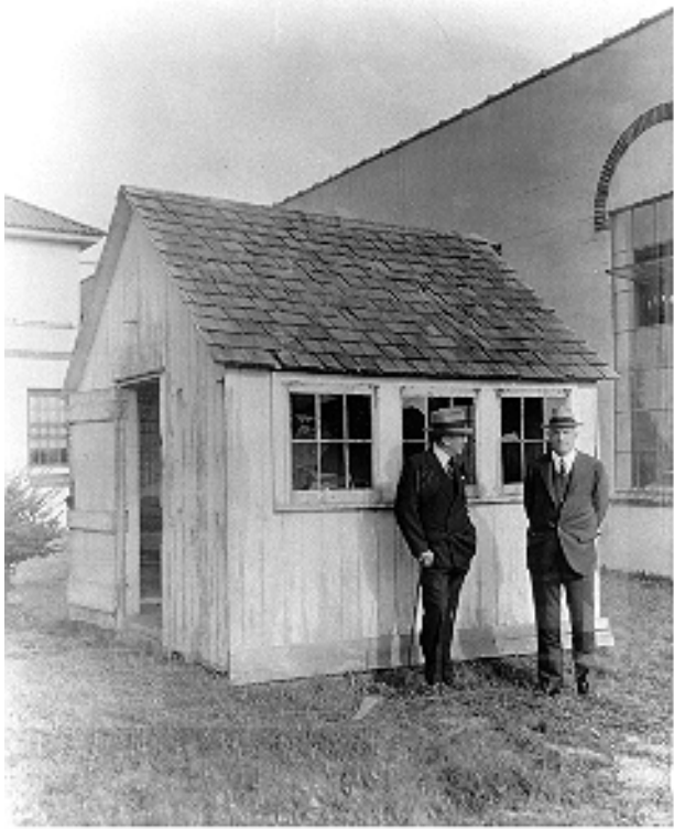
Picture of the original shack after it was moved to the RCA property in Rocky Point, NY (circa 1930). From left to right: Guglielmo Marconi (1874-1937), Edwin Armstrong (1890-1954)